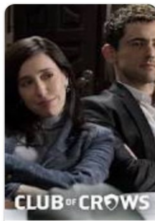
Club de Cuervos 2015 – 2019