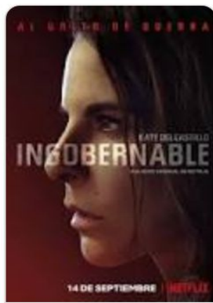
Ingobernable 2017 – 2018