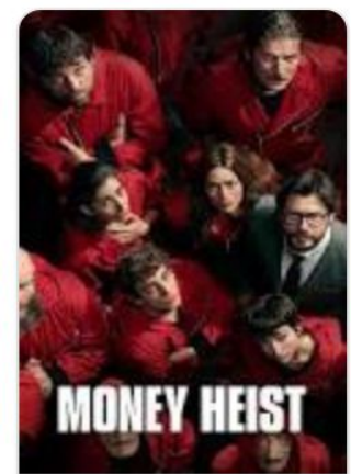
Money Heist Since 2017