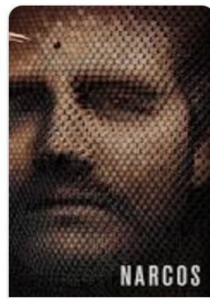
Narcos 2015 – 2017