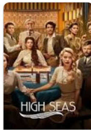
High Seas Since 2019