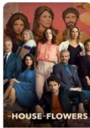
The House of Flowers 2018 – 2020