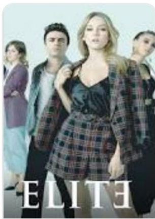
Elite Since 2018