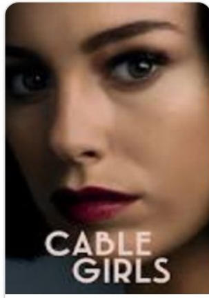
Cable Girls Since 2017